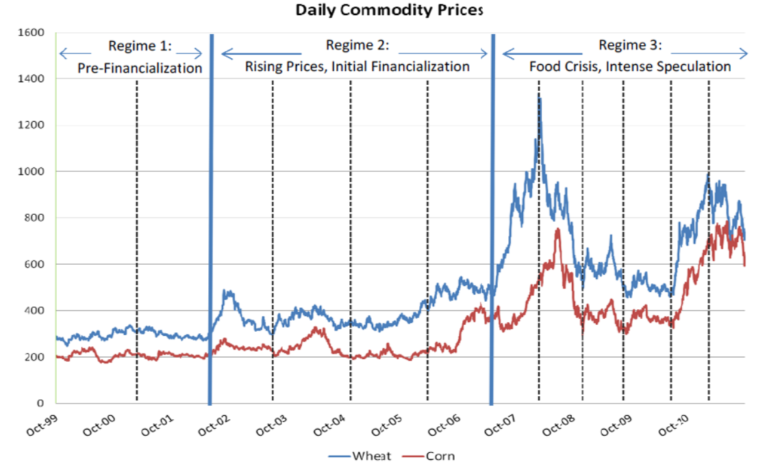
Figure 1: Identification of Testing Subperiods