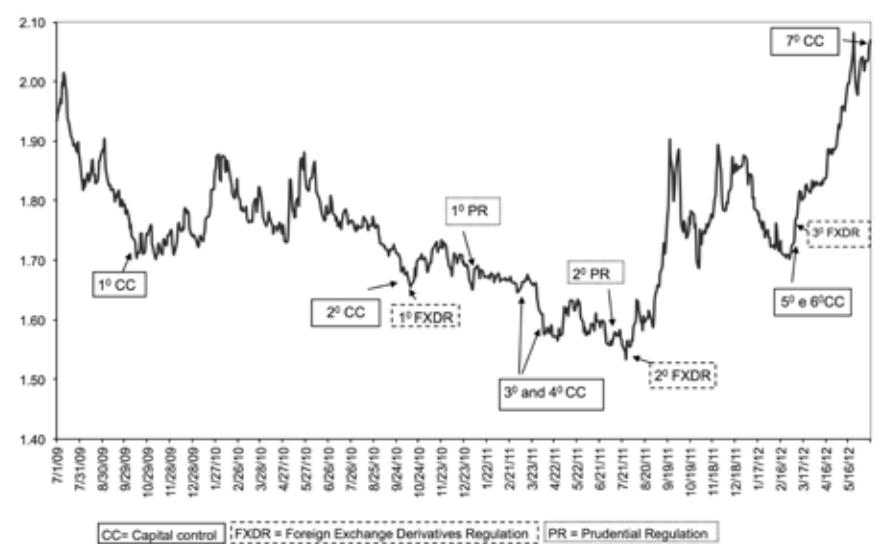
Figure 1: BRL/USD Exchange Rate

The Brazilian regulatory authorities after some time realized this constraint. Since October 2010, they have launched, along with CARs, specific measures to tap these operations, the already mentioned "FX Derivatives Regulation" (thereby FXDR). This new kind of regulation has been revealed to be key in restraining the BRL appreciation trend and, in turn, mitigating the economic policy dilemma faced by the Brazilian government; mainly, that is containing inflationary pressures without reinforcing the exchange rate misalignment (Figure 1).